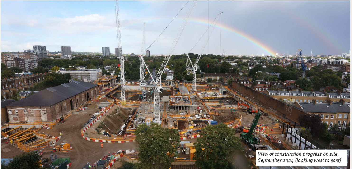
View of construction progress on site, September 2024 (looking west to east)