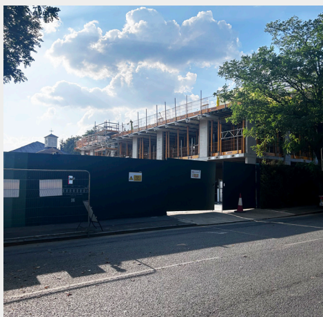
BLOCK 5: View from Ordnance Hill.