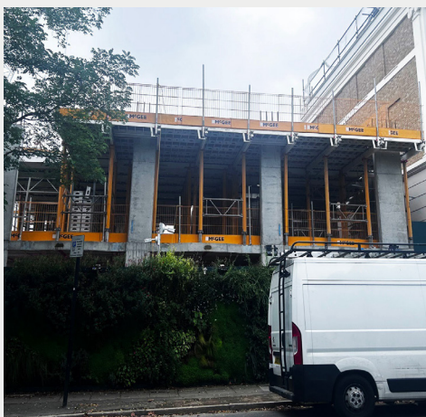
BLOCK 5: The concrete frame is now up to second floor level.