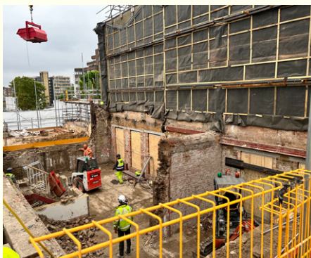
1-7 QUEEN'S TERRACE DEMOLITION: Demolition works at 1-7 Queen's Terrace are on target. By the end of June, the building should have been reduced to ground level.

We have also just completed the installation of new vertical gardens on the hoardings in front of our welfare units on Queen's Terrace. These green walls are not just intended to be visually appealing, but also play a part in soaking up CO 2 .