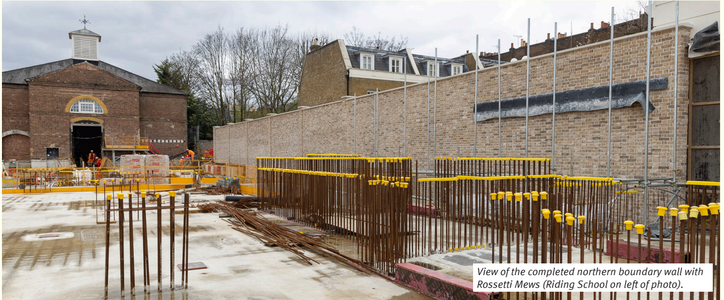
View of the completed northern boundary wall with Rossetti Mews (Riding School on left of photo).