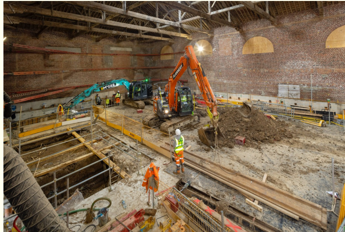
RIDING SCHOOL: Shaft excavation, underpinning, and basement works are taking place within the Riding School.