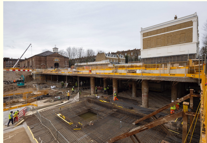
BLOCK 5: The ground floor slab for Block 5 is complete and basement construction is currently taking place.