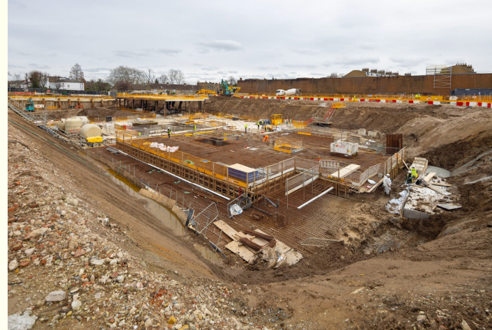
BASEMENT EXCAVATION: The basement raft slabs for future buildings 5, 7 and 3 are progressing in the centre of the site along with continued 'muck away'.