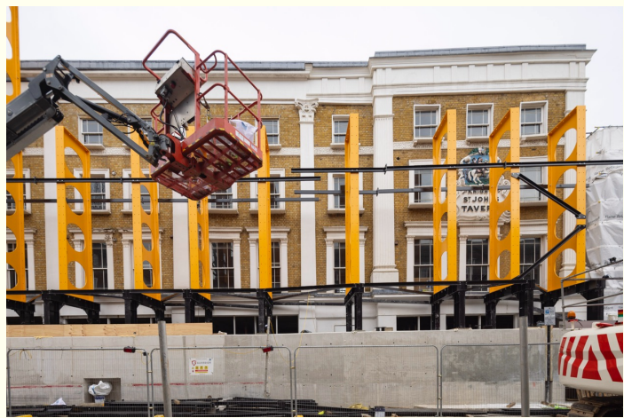
1-7 QUEEN'S TERRACE: The installation of the structural façade retention system has now been completed at 1-7 Queen's Terrace (earlier photos of the system being installed).