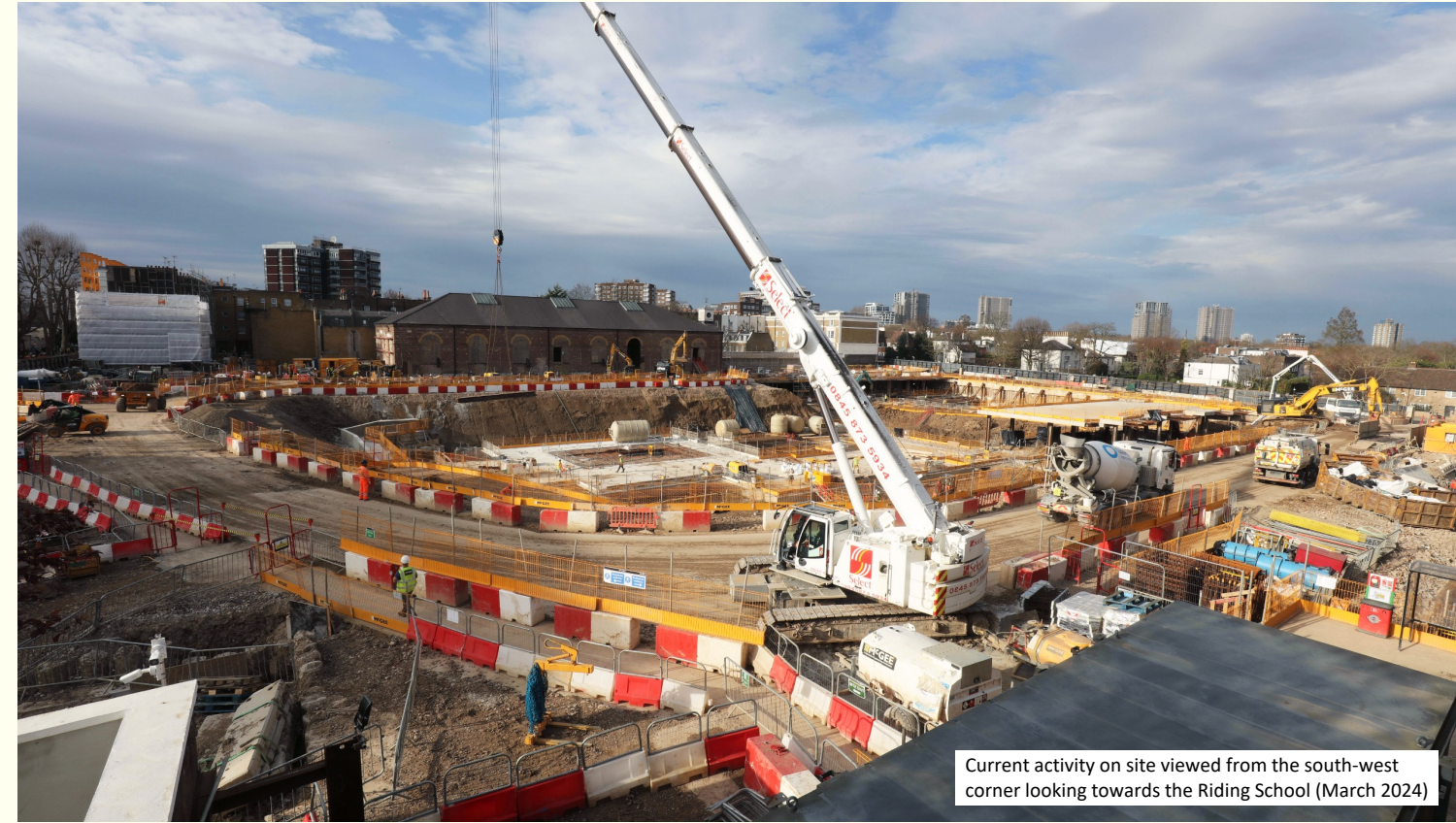
Current activity on site viewed from the south-west corner looking towards the Riding School (March 2024)