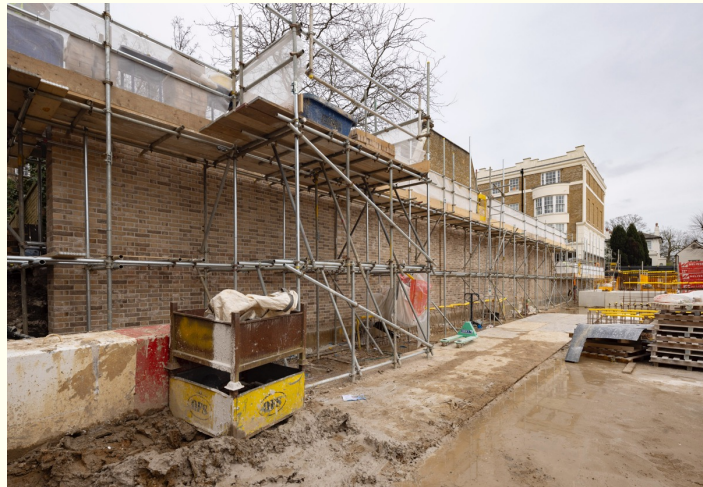
BOUNDARY WALL: The boundary wall at the north of the site between St John's Wood Square, Rossetti Mews and Queen's Grove is now complete.