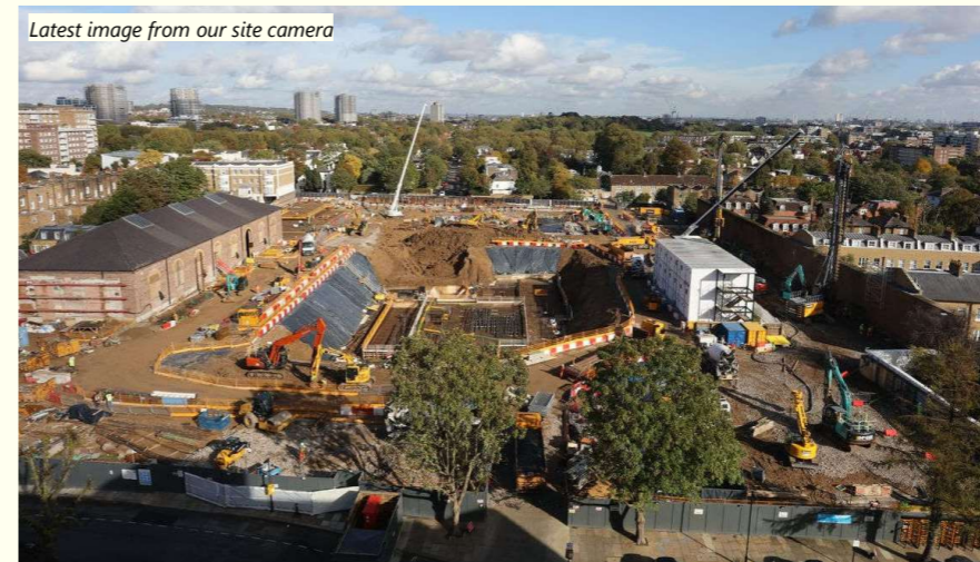
Latest image from our site camera