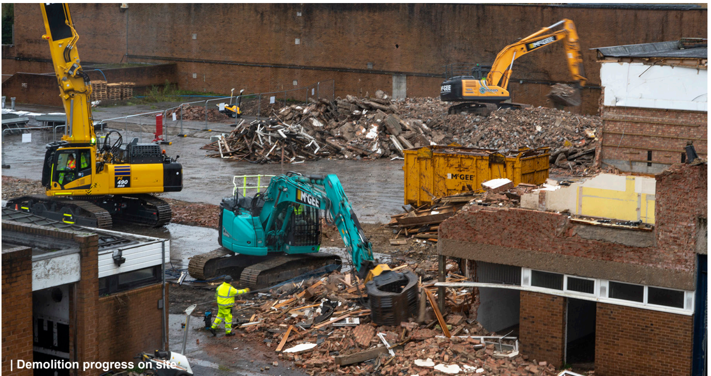
| Demolition progress on site

By December, work will start on the demolition of the old Jubilee Buildings. The long-reach demolition excavator will approach from inside the site, and make a hole in the centre of the building. It will then munch away from the inside, first going north and then south.