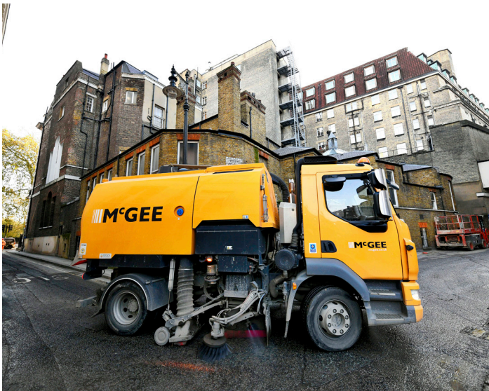
| Street cleaning

On any demolition site, dust is a challenge. Crumbling bricks, concrete, stone and mortar will release dust, and trucks will pick up dirt as they move around the site servicing the project. Our primary aim is to make sure dust is kept within the site as far as possible.