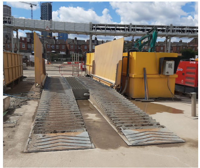
| Wheel washing equipment

When rubble “arising” are formed into piles, we have a special polymer-based gel called DST-4 which is sprayed onto the top, which partly seals the pile, makes it sticky, and keeps the dust in the pile.