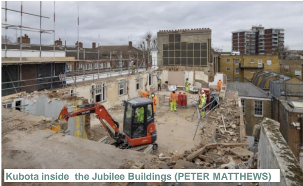
Kubota inside the Jubilee Buildings

The roof of the Jubilee Buildings has been removed, and we have loaded a 3-ton Kubota KX037-4 mini-excavator into the upper section to break the concrete floors. The little Kubota is one of the smallest demolition machines on site, and specially designed to fit into confined spaces as narrow as 1.55m. The Jubilee Buildings, the former accommodation block for the Barracks, is being painstakingly taken down piece by piece using machines and hand tools.